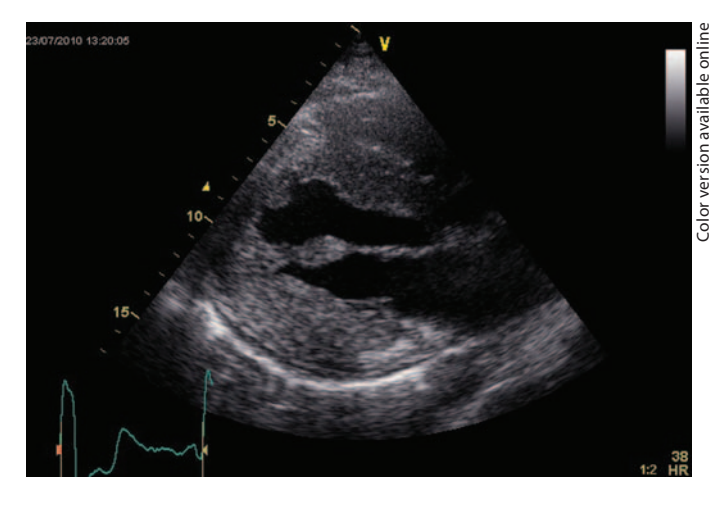
Fig. 1. Instrumental features of case 1. Typical echocardiographic pattern of LV hypertrophy in FD (severe concentric LV hypertrophy).